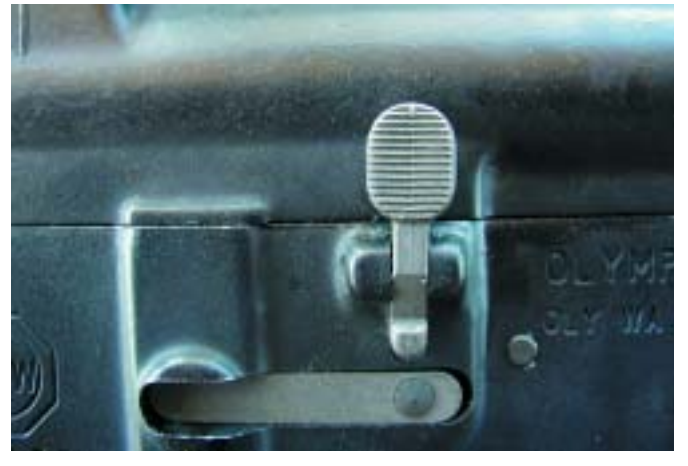
The AR's bolt hold-open is located on the left side of the frame and also serves as a bolt release.