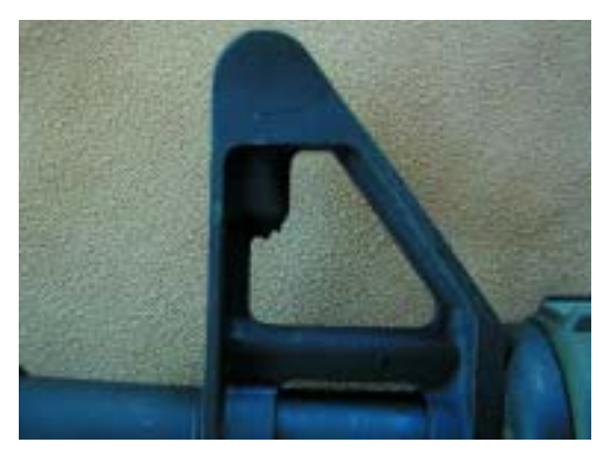
The AR's front sight is enclosed and protected by "wings."

Rock River Arms, Inc. 101 Noble Street Cleveland, IL 61241 (309) 792-5780