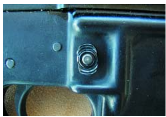
The AR's magazine release is a button located on the right side of the receiver. For speed loads, the author feels this is a better system.

keep a 5-round string barely under six inches, while Flint inexplicably shot a larger group of 7 inches with the AR. This reversal of who shot better with what gun may be explained by the fact that Flint can't quite seem to get used the Ashley dot front sight, and I kept losing the Mini's stainless steel front sight against the light-colored target at that range.