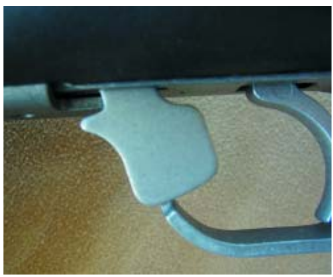
The Mini-14 safety is similar to the Garand, i.e. inside the trigger guard.

Overall, there is no clear "winner" in the Mini-14 versus AR-15 debate. Both have features I like and dislike. As far as person-