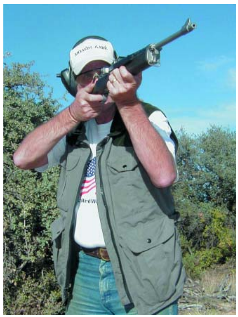
The author practices getting quick hits on the target starting from the ready position.

environment, it is my opinion that the Mini-14 is better than the AR. This is due to the high sight/low bore line on the AR, which forces a shooter to aim high at close range. In the event a head shot is called for, a shooter must actually put the front sight at the very top of the head (or even slightly above) instead of holding dead on the target. For all intent and purposes, this is not a factor with the Mini-14 as its sights are mounted closer to the barrel.