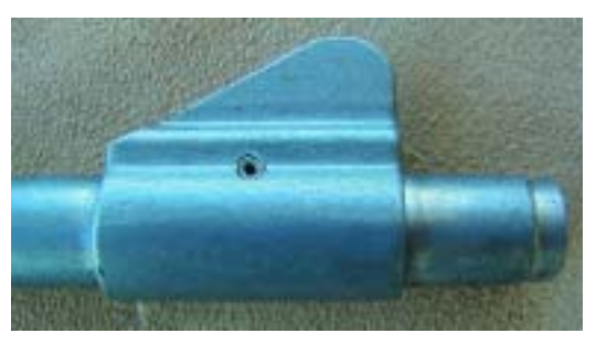
The Mini's front side is a simple ramp.