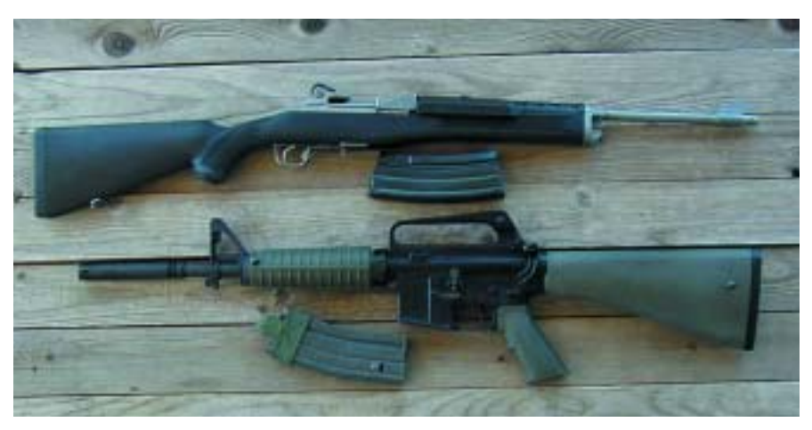
Test guns were Ruger's new synthetic stocked, stainless steel Mini-14 and a pre-ban Olympic Arms CAR-15 with new green stocks from Rock River Arms.

WWW.SWATMAGAZINE.COM RUGER MINI-14 VS. THE AR-15