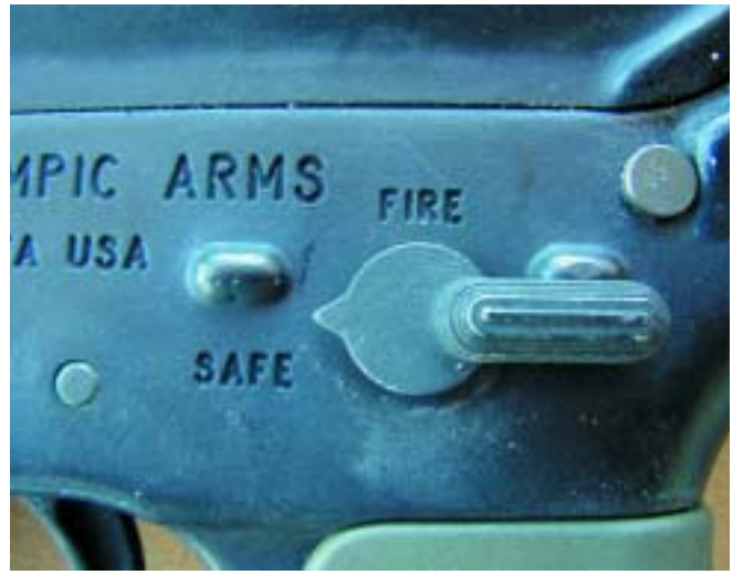
The AR's safety is a selector switch located on the left side of the frame and easily manipulated by a right-handed shooter's thumb. The author personally prefers this system.