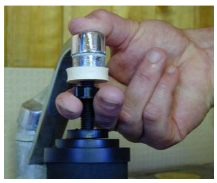
Figure 2 - Place Your Black Berkey Up to Your Faucet for Priming