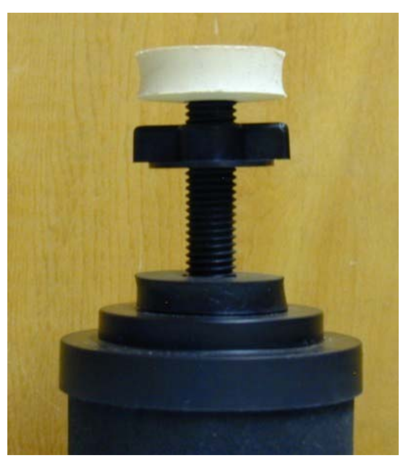
Figure 1 - Black Berkey with Tan Priming Button

Whether you are using a <u>Berkey Light</u>, a <u>Royal Berkey</u>, or any of the other Berkey systems that utilize the Black Berkey purification element, priming is required due to the extremely small pores that make up the filter. These elements need to have water forced through them to clear the air that has been trapped inside the micro fine pores during production. Begin by opening up your black berkey box and verify that each element has a rubber washer and a wing nut attached to it. Also inside the box you'll find your priming button, a tan rubber washer. It will be thicker than the element washer with a smaller center hole. See Figure 1.